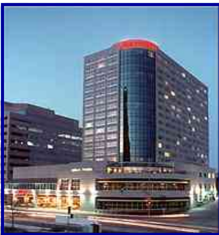
The Marriott Country Club Plaza Kansas City Missouri

As the Central Region President, I am looking forward to a large Michigan representation at the conference. See you there!